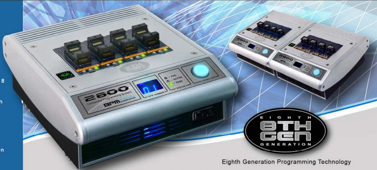
Eighth Generation Programming Technology