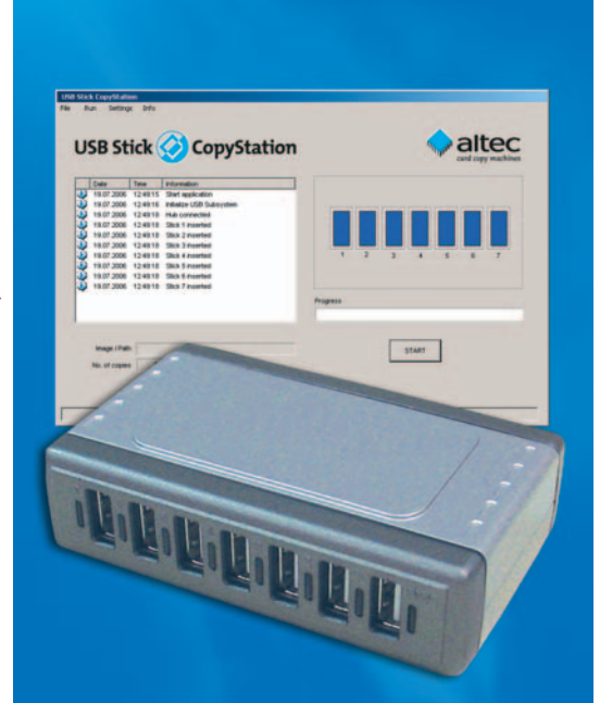
Software and USB 2.0 hub – hardware part of the USB Stick CopyStation